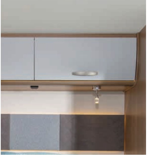
Over-head locker doors with soft-close