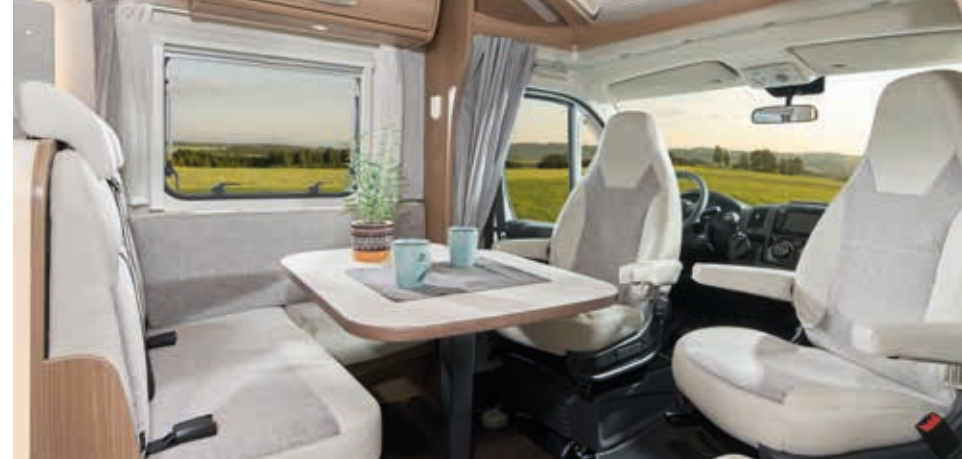
Bathroom Seating group