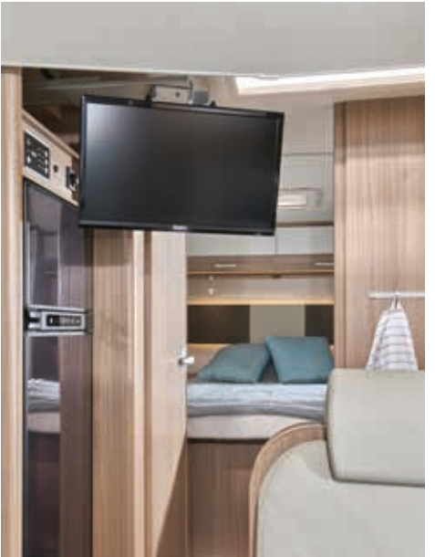
Living room with fold-down bed