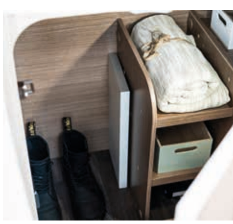
Wardrobe under bed