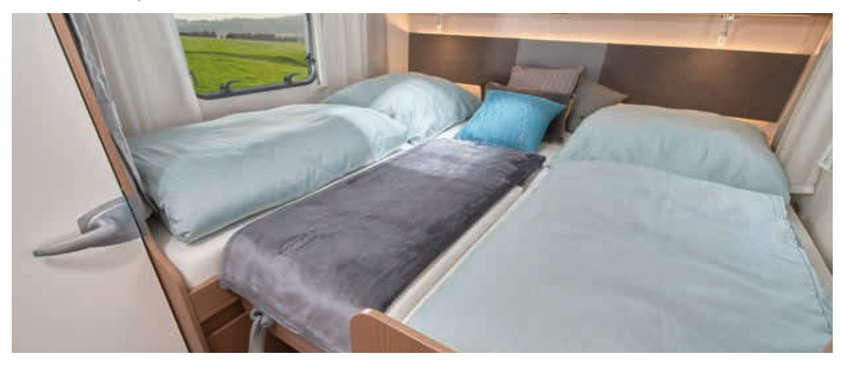
Bed conversion single to double bed